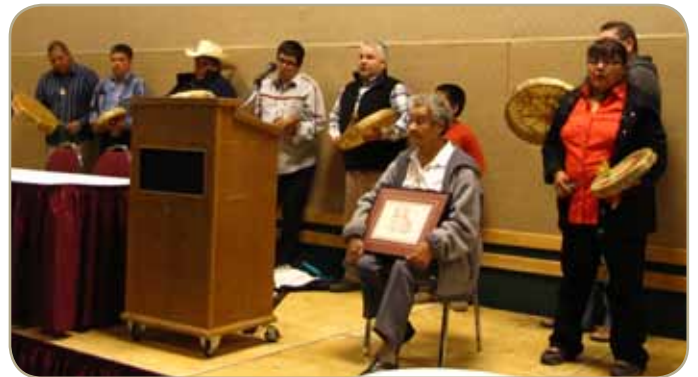
SECWPEMC honouring grandmothers.