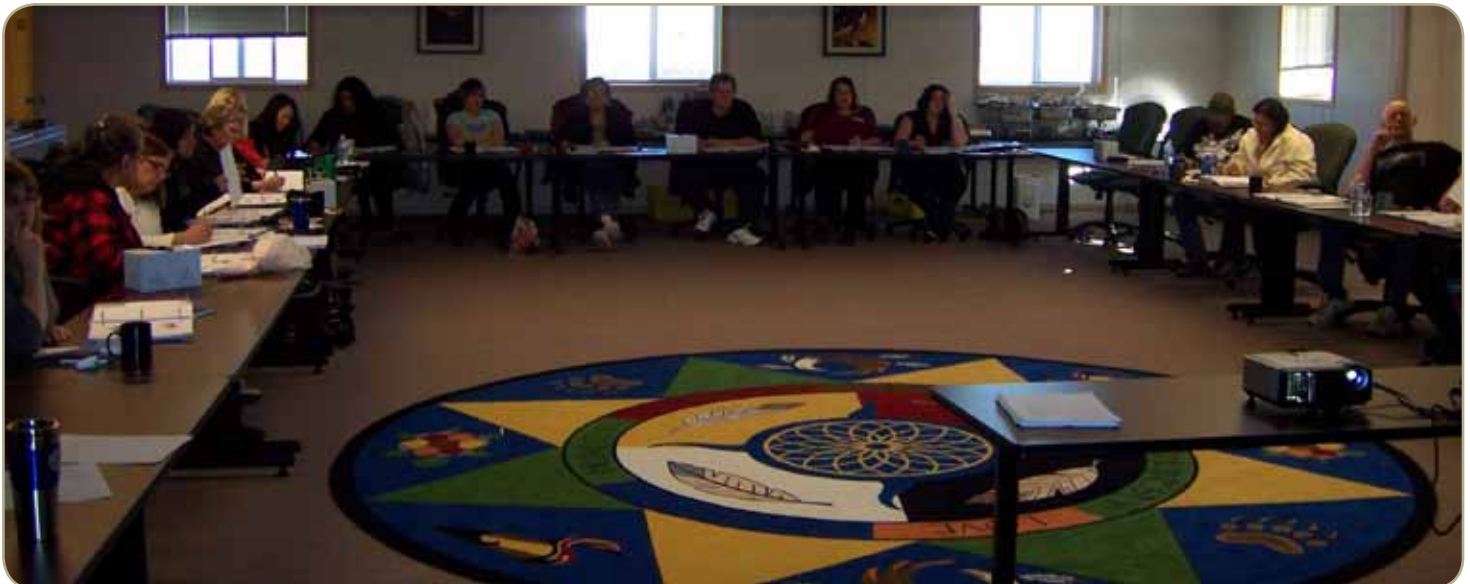
Foster parent training in Kamloops.