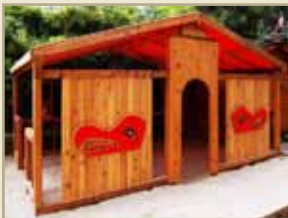
Eagle's Nest Aboriginal Preschool

Our play-based preschool program for 3-5 year old Aboriginal, Métis and Inuit children currently has spaces available and we are also registering children for September 2011. We deliver curriculum in an Aboriginal context that fosters social, emotional, physical, spiritual, cognitive and creative development.