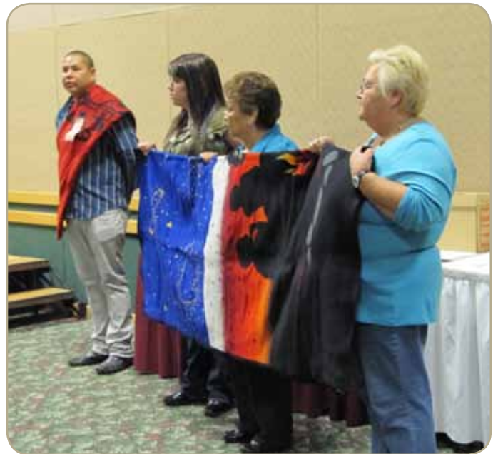
Board members with honouring blanket.