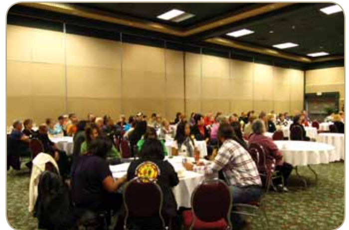
Child welfare conference.